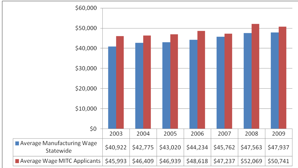
Figure 2 Average Wage - Manufacturing Statewide and Manufacturing Investment Tax Credit Applicants

As shown in the table below, Statewide manufacturing jobs declined for every year covered by this report.